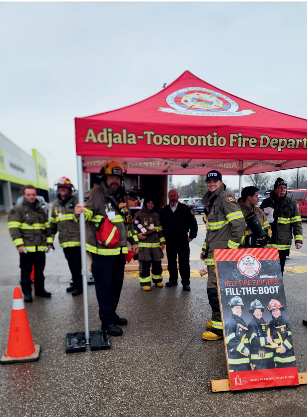
Above: On March 15th members of the Adjala & Everett Firefighters Associations held their Annual Muscular Dystrophy Boot Drive. Thanks to the generous support from the community, there was a total of $6,818.50 raised for this great cause. Many thanks to those who contributed.

If you are unable to check your smoke alarms, the Adjala-Tosorontio Fire Department will visit your home.