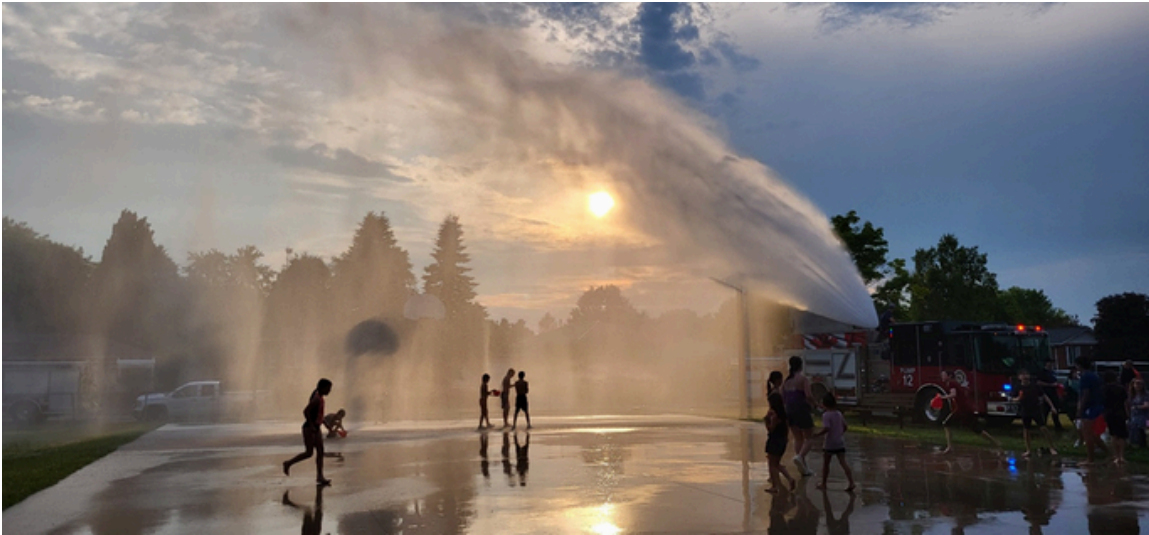
Above: ATFD Firefighters host a “Water Party” on June 18, 2024 at Central Park in Everett. In the summer months it is common to find the Adjala-Tosorontio Fire Department flowing water to cool off residents on hot days. Such events provide an informal opportunity for public education and relationship building between ATFD Firefighters and the community.